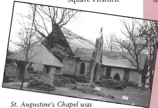
St. Augustine's Chapel was designated a Raleigh landmark in 1969.

The designation of the Moore Square Historic